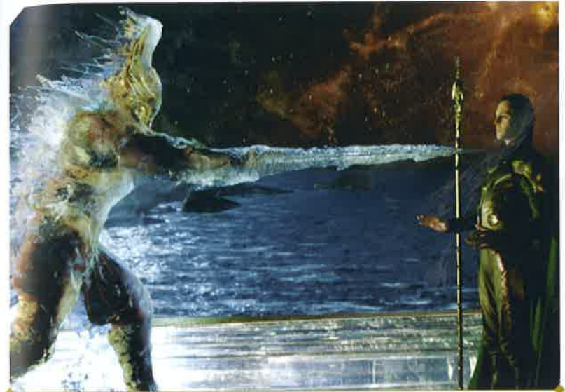
The ice covered Heimdall's body and then his face. He couldn't move. He stood, frozen, outside his guard post at the end of the Rainbow Bridge.

"My brother must not return to Asgard," Loki said. "Stop him. Destroy him."