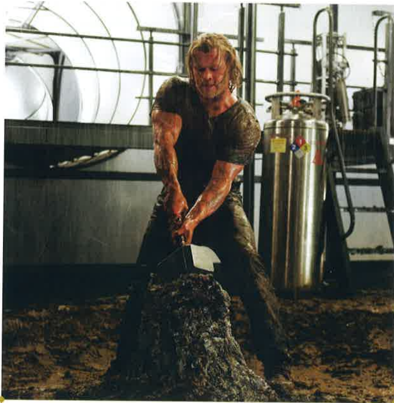
He smiled again and pulled, but Mjolnir didn't move.

"Stay here," Thor said. "I will get Mjolnir, then I will find your notes and equipment. O.K.?"