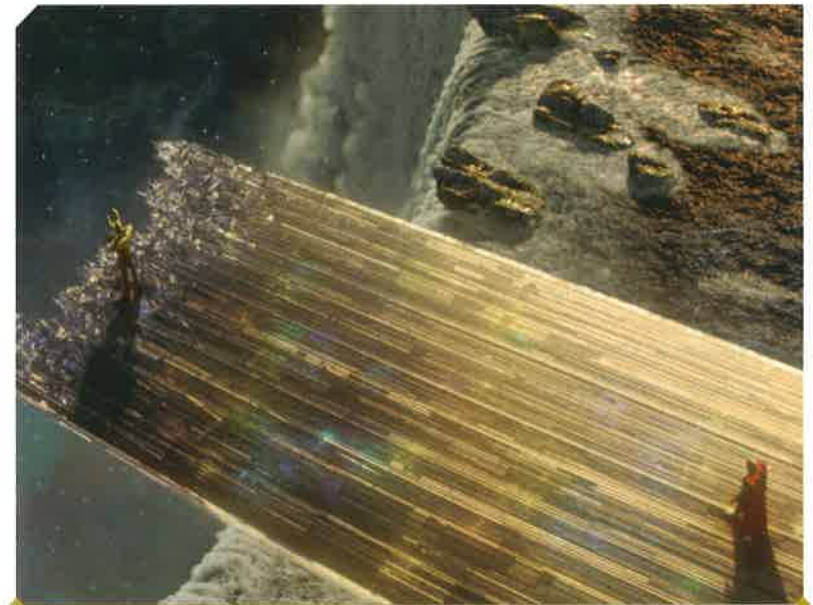
Thor walked out onto the broken end of the Rainbow Bridge. Heimdall was standing there, looking out at the stars.

Thor smiled. Yes, there was always hope.