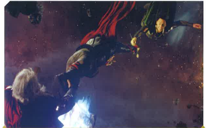
Loki took his hand off Gungnir and fell.