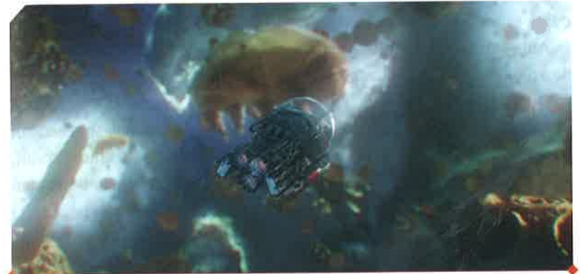
Small things looked like giant animals here.

Hank looked at the subatomic world around him. Everything was very beautiful, and the colors were wonderful. Small things looked like giant