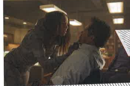
Ghost put her face close to Luis.

Ava put on her suit. "I'll find the lab," Ghost said.