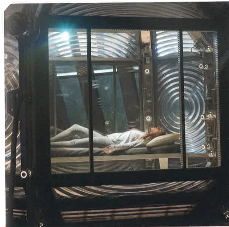
They saw the young woman on the bed in the glass box, asleep

Scott loved working with Hope again. "It's like the old days!" he said.