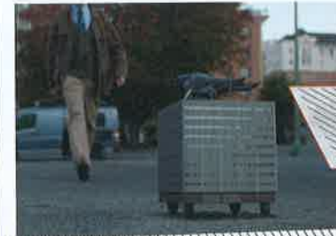
Hank shrank the lab to the size of a sports bag.

and put it on the road. WHOOSH! The van was now full size, and Hank opened the door.