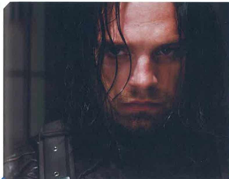
As Barnes watched the video, painful memories of his life as a Winter Soldier came back to him.

"Don't try to save your friend. Did you know?" Iron Man asked again, his voice shaking.