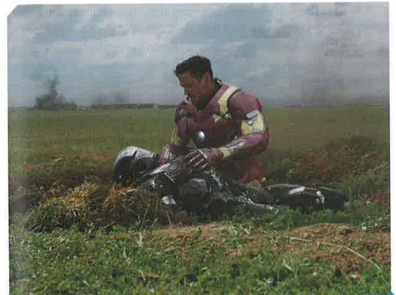
Iron Man flew down, landing on his knees next to his friend. War Machine's eyes were closed and he didn't move.

Vision flew down onto the field in front of Iron Man and looked down at the dying War Machine. He felt very bad about not protecting his team better.