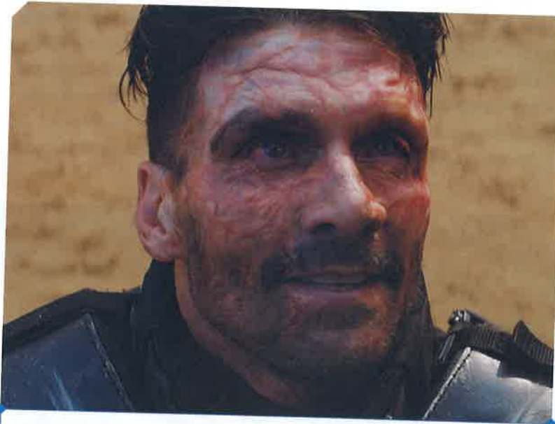
Captain America saw the terrible burns on his face.

"Oh, no ...! We need firefighters and doctors on the south side of the building urgently!" Captain America shouted to Falcon.