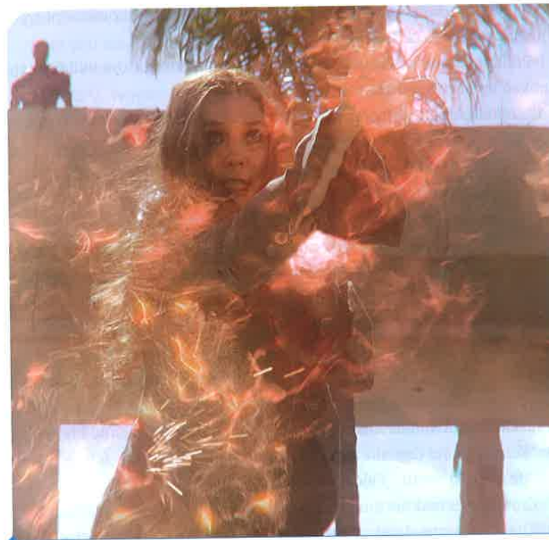
With one hand, Scarlet Witch easily pushed their bullets away.

Crossbones's men continued shooting. With one hand, Scarlet Witch easily pushed their bullets away. She picked up one of the men and threw