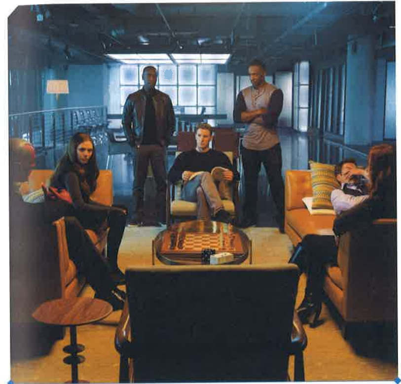
The Avengers sat and discussed the agreement for more than an hour.

The Avengers sat and discussed the agreement for more than an hour. Rogers didn't like the idea. Wilson agreed with Rogers. Rhodes thought it was a good idea. They could all work in a more organized way.