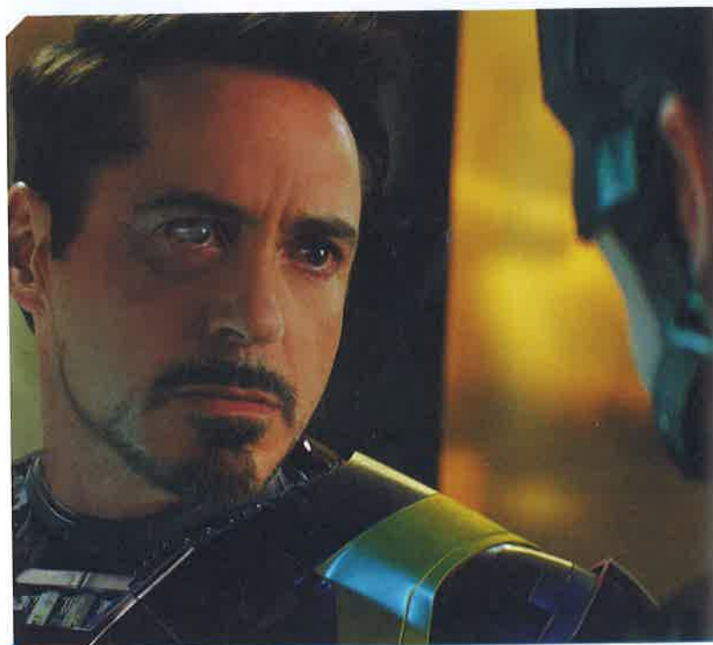
Iron Man turned to Captain America and asked angrily, " Did you know? "

KAPOW! WHAM! He attacked Rogers and Barnes again.