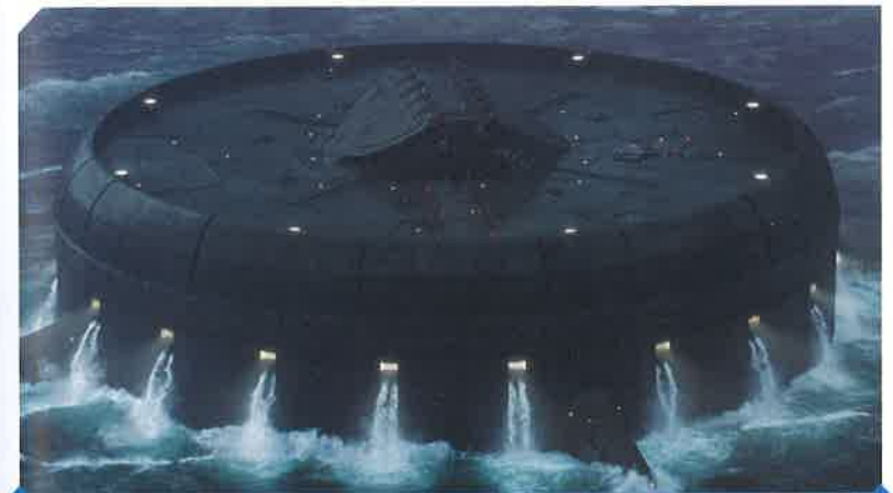
In the middle of the ocean, Stark brought down the helicopter on the roof of the United Nations' secret prison.

"O.K., Barton, I had no idea that they wanted to put you here," said Stark quietly.