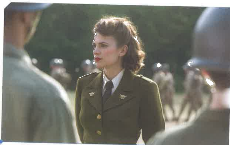
"And this is Agent Carter, from the British Army."

"Come here, Hodge," she said—and then she punched him hard in the nose.