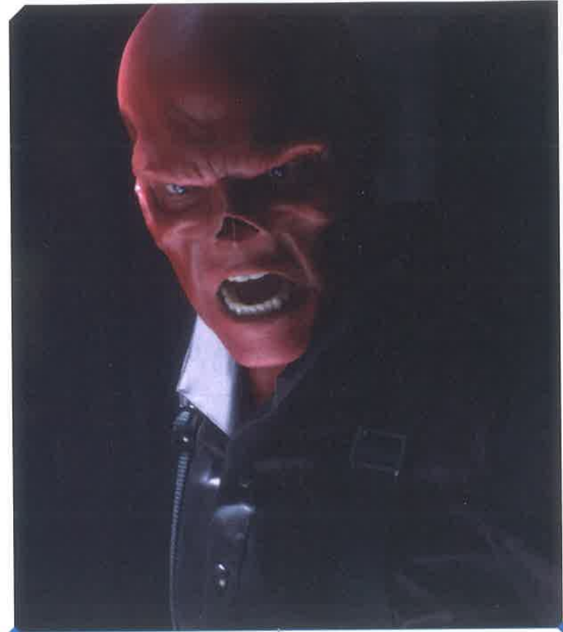
Under the mask, he had no face—only a skull.

Steve angrily punched Schmidt as hard as he could. The head of Hydra fell. He stood up and smiled before he punched Steve.