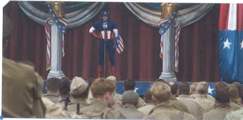
The soldiers looked at Steve and he looked at them. They were tired and hungry, and they didn't smile.

"I hope you didn't see the show," he said. "It was Senator Brandt's idea. I never wanted this life. But let's not talk about me. What are you doing here?"