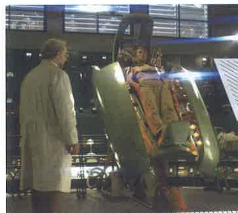
Dr. Erskine took Steve to the large machine. It was the size of a man.

We are giving it to Private Steve Rogers of the U.S. Army. Private Rogers will be the world's first Super Soldier!"