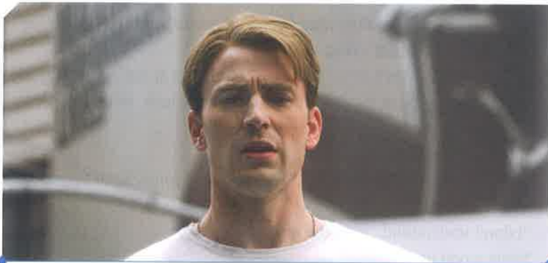
He looked around at his new world—and he thought about Peggy.

"But I'm late," he said. "I'm too late."