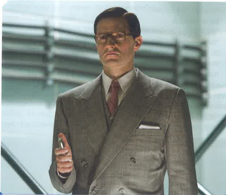
The man took the serum and turned around.

"That man's name is Kruger!" cried Dr. Erskine. "He's a Hydra agent! Stop him!"