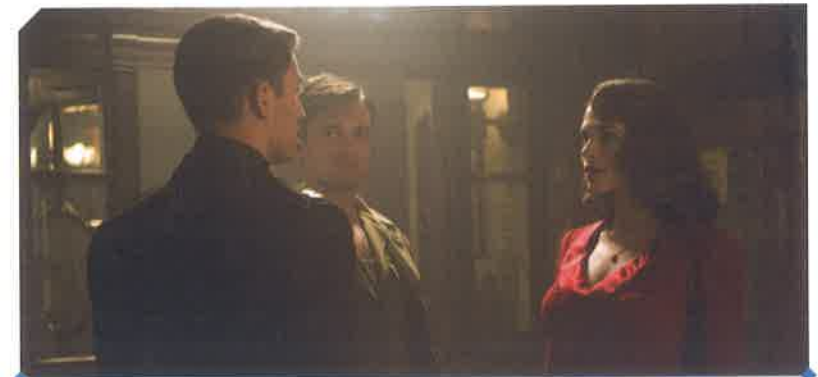
This evening, she looked beautiful in a red dress.

Steve felt good. He was a soldier. His best friend was with him. He had a great team. And maybe he had a future with Peggy. Yes, he felt really good.