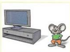
ON THE RIGHT OF – DESNO OD