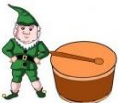
ON THE LEFT OF – LEVO OD