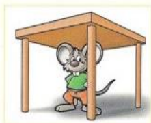
UNDER – SPODAJ, POD