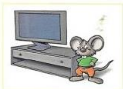
NEXT TO – ZRAVEN, POLEG