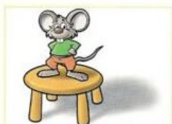
ON – NA