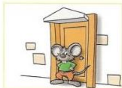
IN FRONT OF – PRED, SPREDAJ