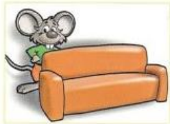
BEHIND – ZADAJ