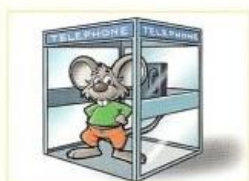
IN – V