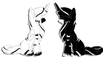
OPPOSITE – NASPROTI