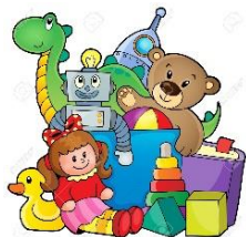
TOYS - igrače

V povezavi z igračami boš ponovil/a uporabo have got in has got (imam, ima).