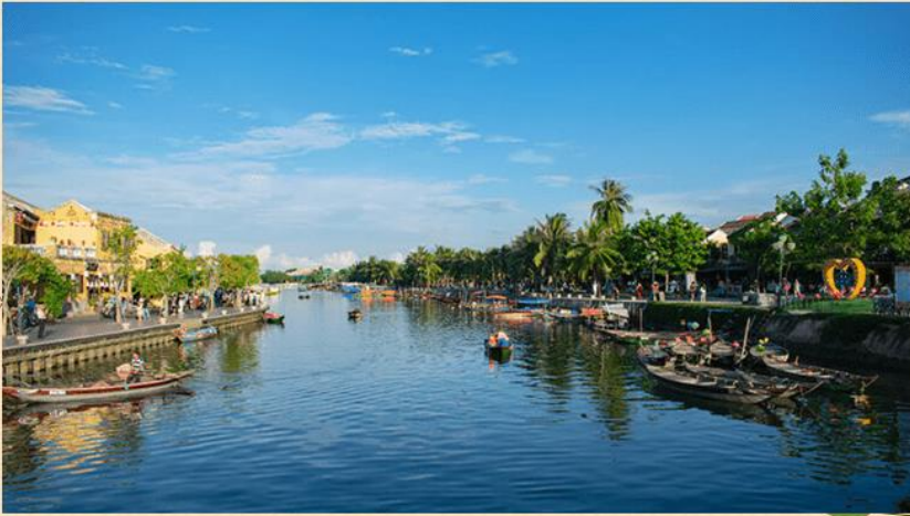
Thu Bon River