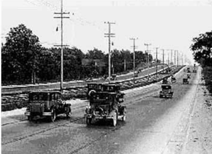
Woodward had a bit more open space and fewer cars in 1931.

Woodward Avenue in Detroit, Michigan, carries the designation M-1, so named because it was the first paved road anywhere.