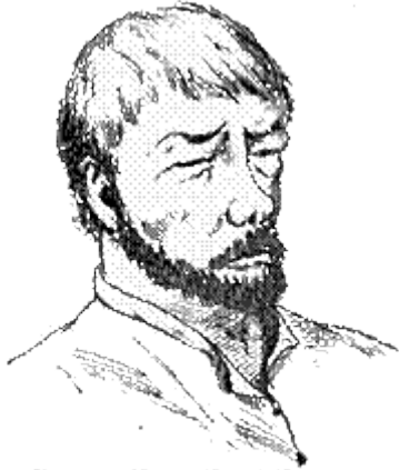
Pierre "Pig's Eye" Parrant

St. Paul, Minnesota , was originally called Pig's Eye after a man named Pierre 'Pig's Eye' Parrant who set up the first business there.